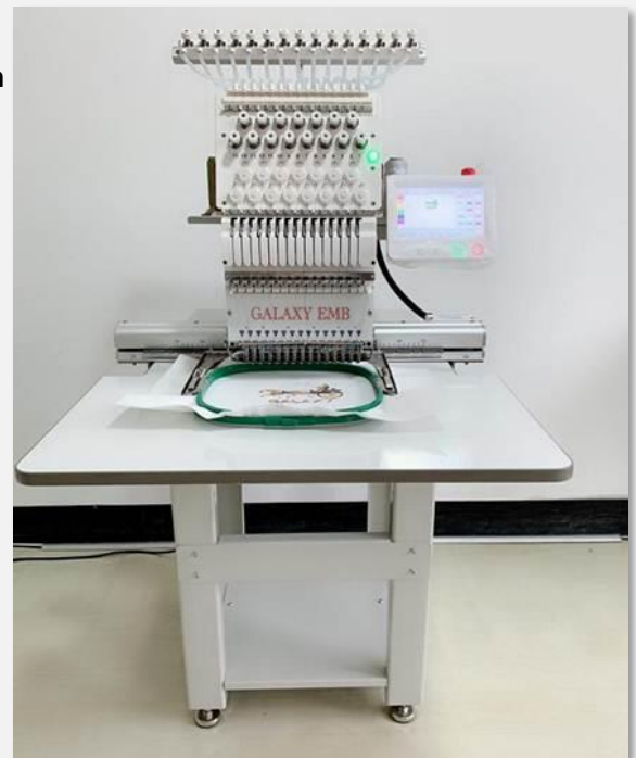
Machine is supplied with table