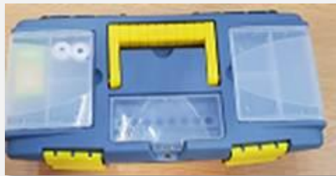
Complete spare parts and toolbox